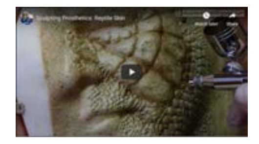
<u>Check this blog post with video where we</u> <u>did something similar using cap plastic on</u> <u>a reptile skin effect.</u>

Photograph this finished piece and then you can simply peel off the dry latex leaving you with a reusable plaster head and plaster lean, ready for something new.