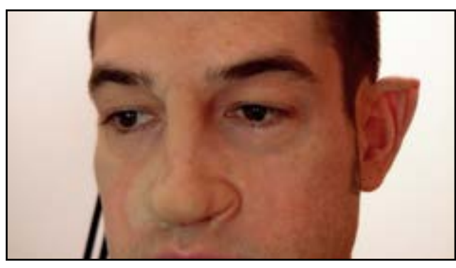
Close-up of Werewolf makeup midway through application. Gelatine werewolf appliance makeup for a show. Millennium FX 2002. Note that half the appliance is unpainted, revealing the appliance base colour against the skin.

The reason for this is that if a small piece of rubber – like a chin or a nose – is the only fake thing on an otherwise real face, then there is a lot of real skin there to compare your rubber to.